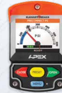
APEX 200 Valve Control with Pressure