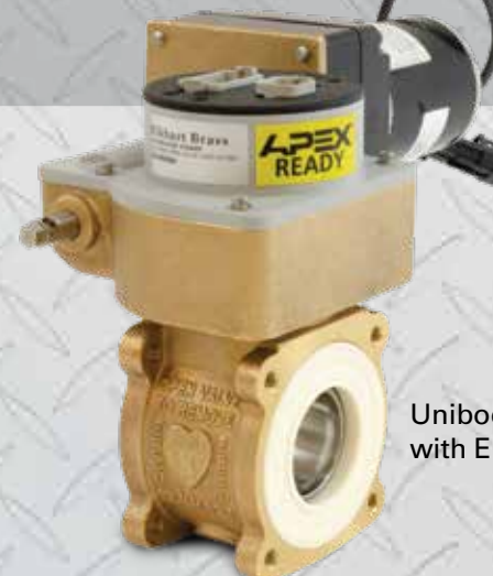
Unibody valve shown with E14X actuator