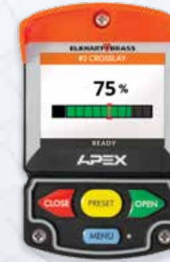
APEX 100 Valve Control