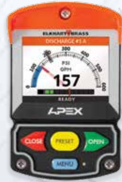
APEX 300 Valve Control with Pressure and Flow