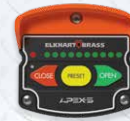
APEX S Compact Valve Control