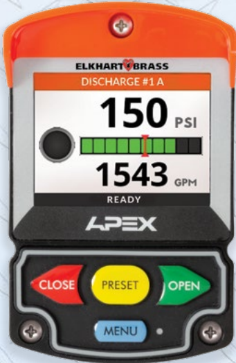
APEX 300 shown with optional numeric pressure readout.